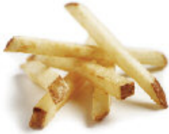
Maximo Sun Gold 5/16" SC Skin-On