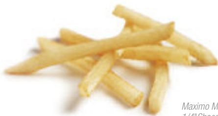
Maximo Mighty Crisp 1/4" Shoestring

Venture Brand Foods French fries, hash browns and formed products offer your customers the rich potato taste and scratch-made look they crave, while giving you a great selection and some of the finest quality products in the industry.