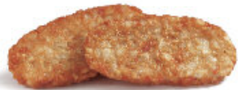
Maximo Hash Brown Patties

For breakfast, lunch or dinner, Maximo Rounds are the ultimate, do-everything side dish. Baked or fried, they're an excellent addition to any menu.