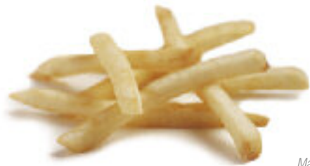
Maximo Sun Gold 1/4" Shoestring