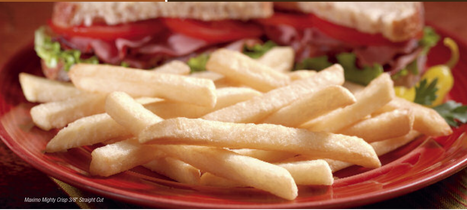
Maximo Mighty Crisp 3/8" Straight Cut

Venture Brand Foods French fries, hash browns and formed products offer your customers the rich potato taste and scratch-made look they crave, while giving you a great selection and some of the finest quality products in the industry.